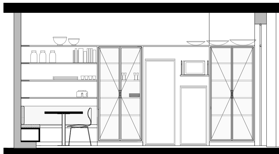
CORTE B ESC.:1:50